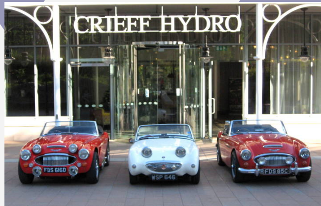
Healeys at the Crieff Hydro Reception Would you like your car to be here in 2013 !!

terrace are available as well as a choice of over 40 on-site leisure activities. Daily childcare for 2-12 year olds is also on offer. The hotel can be reached easily from the cities of Edinburgh and Glasgow in 1 hour.